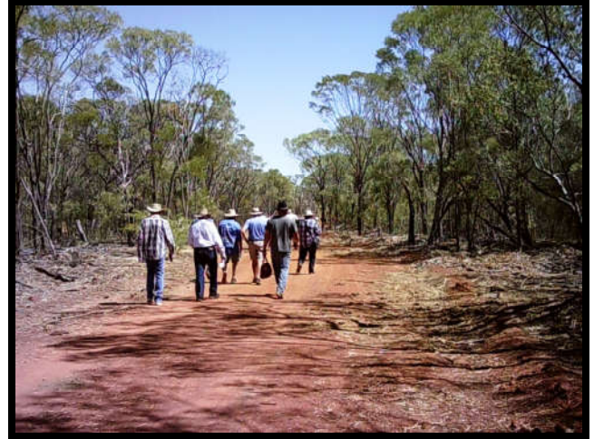
The walk into Hayfield Station to the joining pole.