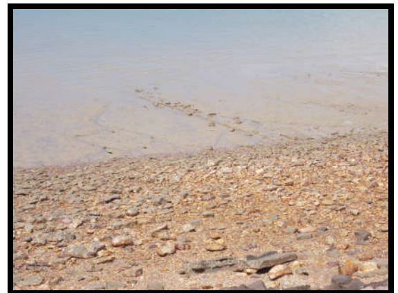
Part of the cable can still be seen when the tide is out.