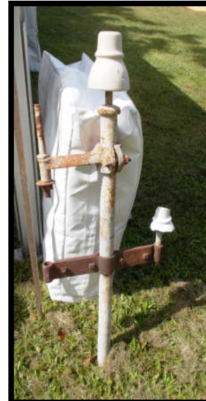
Overland telegraph line display