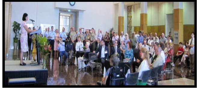
Natasha Fyles, Chief Minister addressing the audience at Parliament House