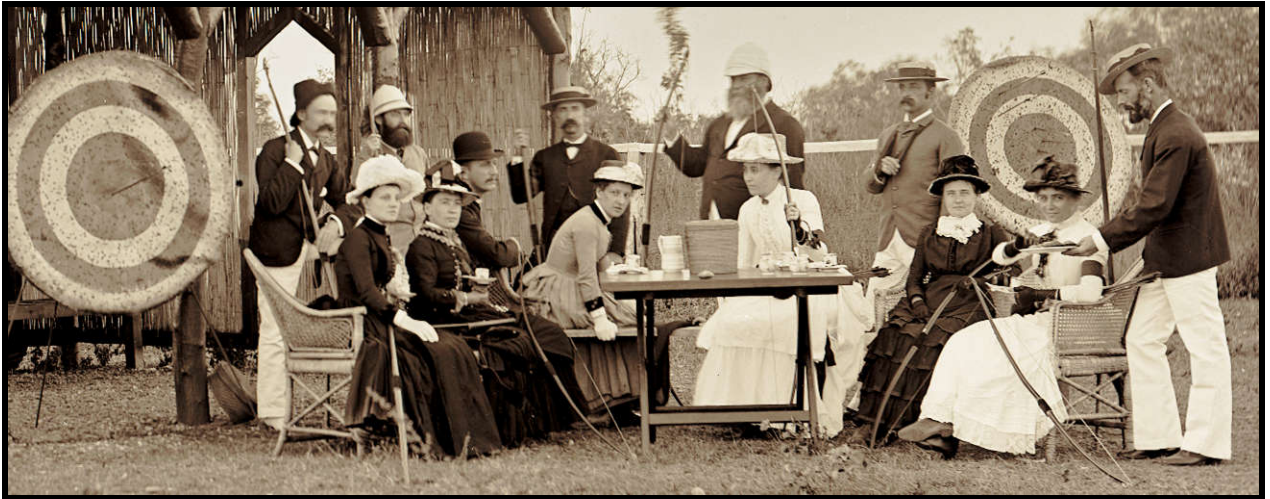
Photograph: Palmerston Archery Club, 1888.