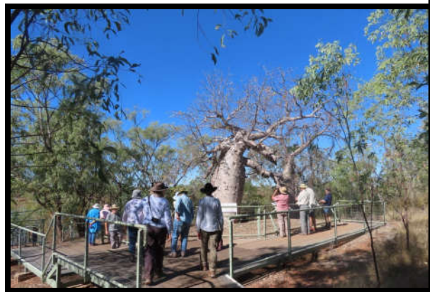
Gregory's Tree. Photograph courtesy Brian Reid