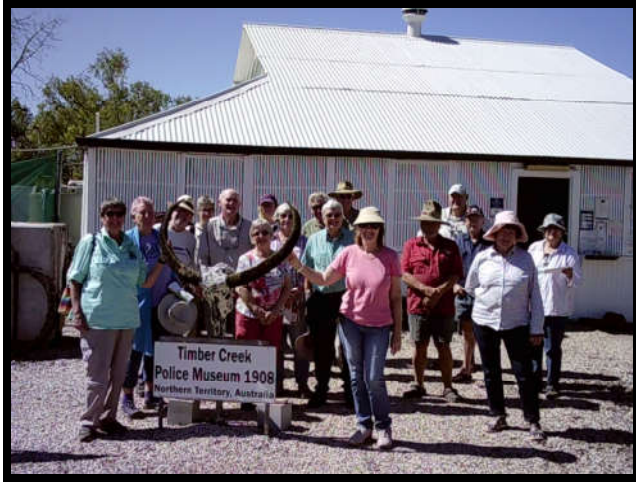
The group at Timber Creek Police Museum

The places we visited were Joe's Creek Escarpment Walk, Timber Creek Police Museum Nackaroo Lookout, Bullita Homestead & stockyards and Augustus Gregory tree.