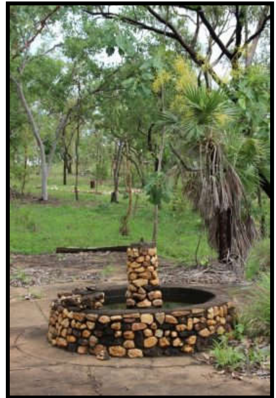
Officers Mess fountain