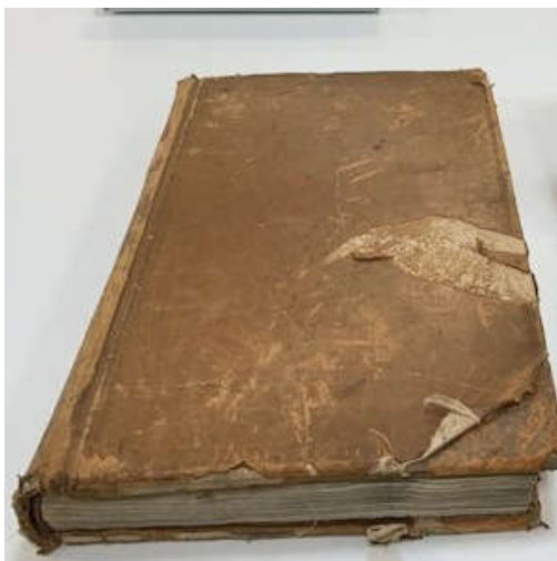
One of the ledgers. They are very large and heavy.